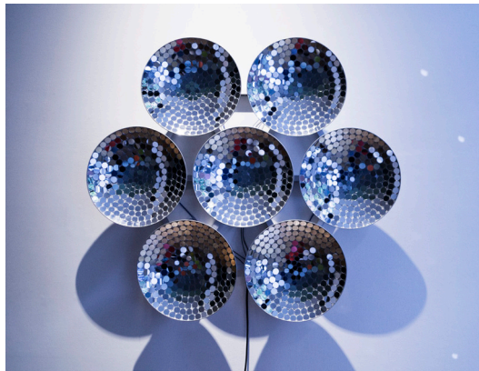
Kiichiro Adachi 7 faces 2017 mirror, motor, aluminum, pulley, belt, mixed media 45" x 52" x 7"