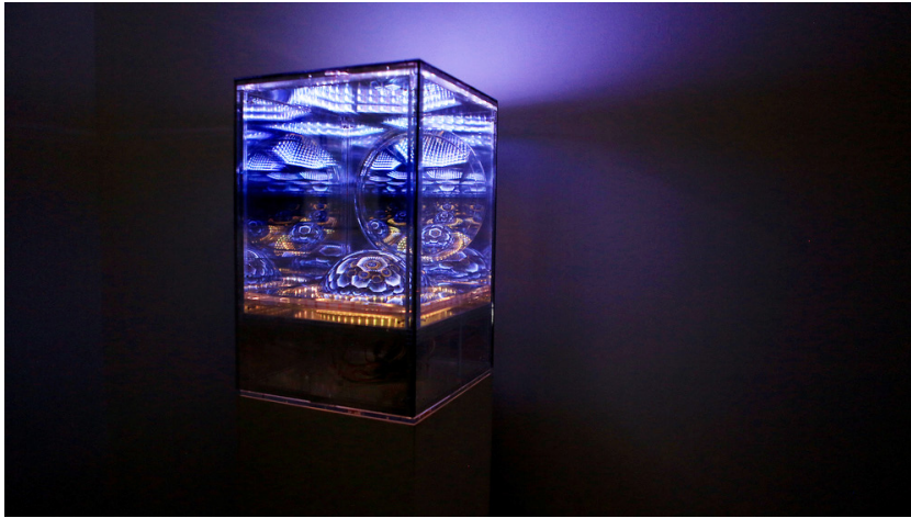
Gabriel Pulecio Saturn Submerged 2017 Acrylic Mirror, LEDs, Computer 10" x 10" x 15"

Opening Reception -March. 14th, Wednesday, 6pm-9pm in conjunction with Tribeca Art Night #7